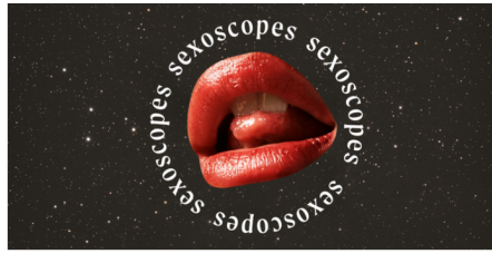
Your Sex Horoscope for the Weekend