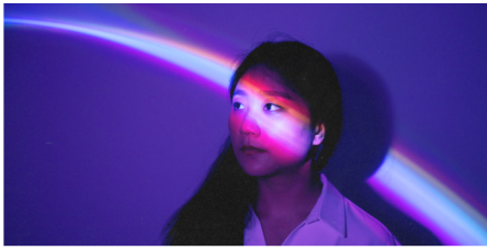
What Is the Asexual Spectrum?