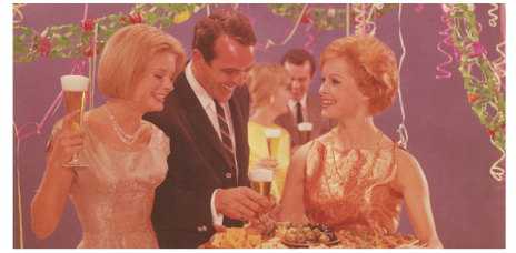
R.I.P.: Here Lies "Swingers"