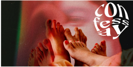
My First Threesome With a Woman