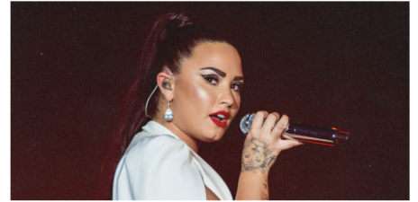
Lotsa People on TikTok Relate to Demi's Song "29"